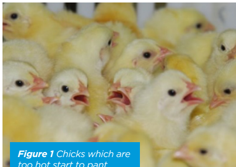
Figure 1 Chicks which are too hot start to pant.

To measure vent temperature, hold the chick with its vent towards you, and use your thumb to push the rump upwards.