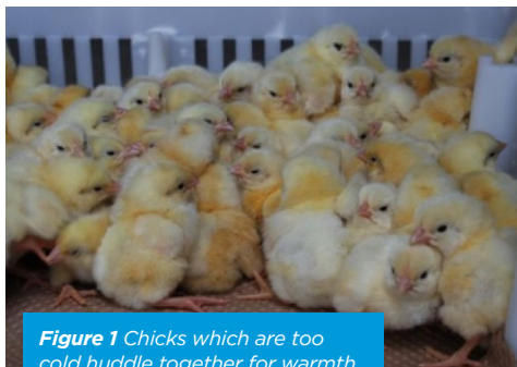
Figure 1 Chicks which are too cold huddle together for warmth.